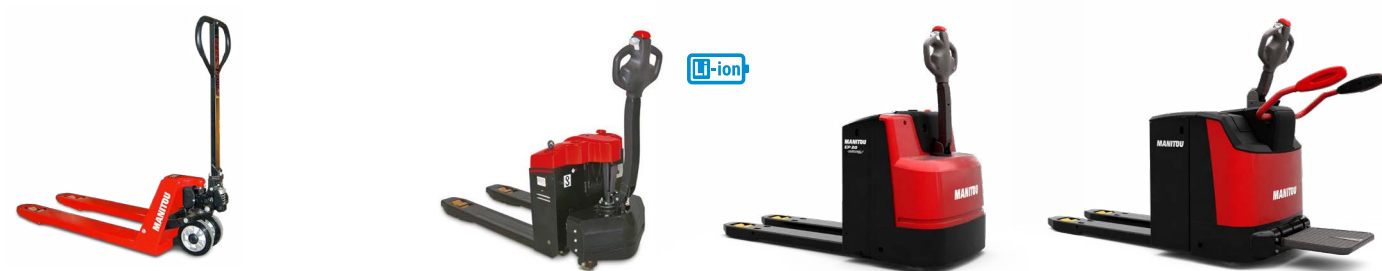
EH Model Manual pallet truck for basic daily transfer. EP Model Electric pallet trucks with a capacity from 1,5 ton to 5 tons.