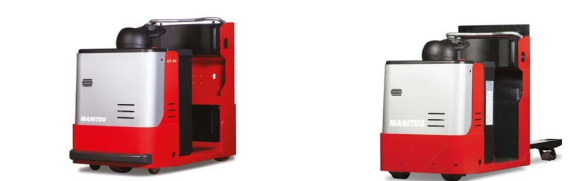
CT Model Tow from 3 to 5 tons. CI Model Optimise your logistics thanks to order pickers up to 2 tons.

Our new range provides complete autonomy across your handling operations in the industrial and logistics sectors, including: order preparation, goods conveying, truck loading and unloading, and feeding of production lines.