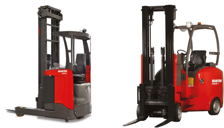
ER & EMA Models Our ER and EMA ranges are built for your most intensive logistics needs by providing unmatched compactness in narrow aisles and lift heights up to 12 meters.