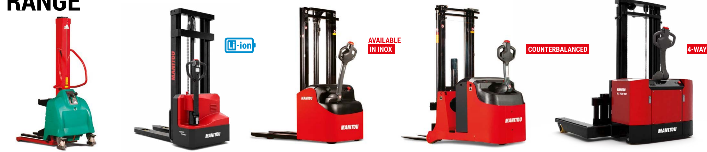
ES Model Wide range of stackers up to 3 tons capacity to answer all your requests. The counterbalanced version will give you optimised solutions for all kind of loads.