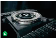
Robust heavy duty swing bearing design for increased load capacity and reduced downtime.