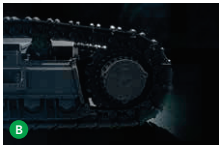
The heavy duty sprocket increases durability for an extended equipment lifespan.