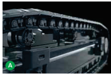
The larger rollers in the newly upgraded undercarriage account for superior performance and longevity.