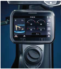
Smart power control

Pairing this advanced feature with the EPOS Controller ensures optimal hydraulic flow allocation, minimising fuel usage and reducing operating costs.