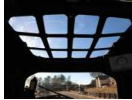
Comfort Better visibility