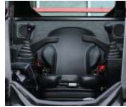
Joystick Ergonomics and precision for easy handling