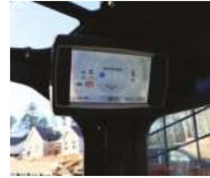
New display Intuitive use

Ease of use Keyless start, smart throttle and intuitive lighting help inexperienced operators become productive faster.